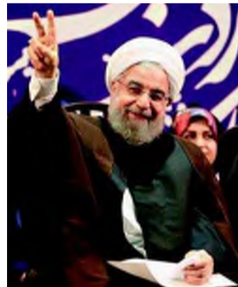
Upper hand Rouhani will stand up to be counted

He went on to add that "until the Iranian regime is willing to be a partner for peace, all nations of conscience must work together to isolate Iran, deny it funding for terrorism, and pray for the day when the Iranian people have the just and